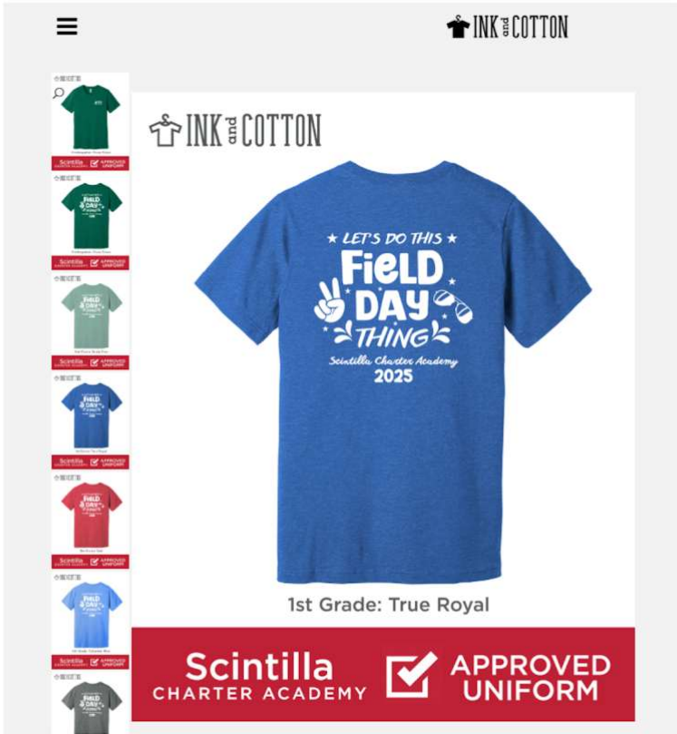
Field Day TShirt

GET YOUR FIELD DAY T-SHIRT FIELD DAY WILL BE FRIDAY, MARCH 28TH